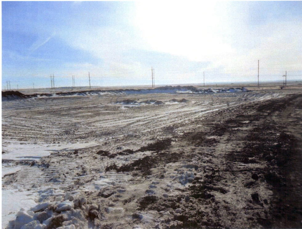
Report Photo #2 "Tree shrub row on north side" at GPS Coordinates: 48.286667°N 103.322222°W